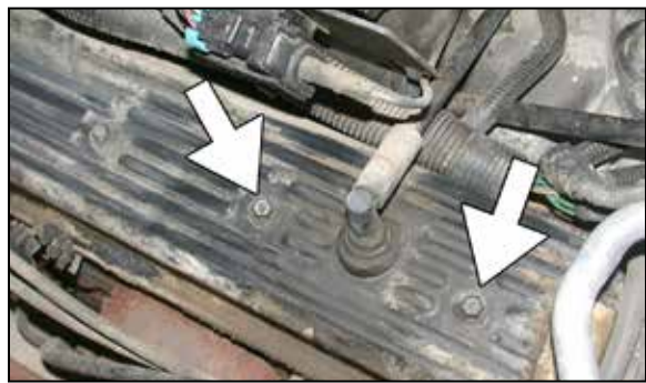
15. Remove the two valve cover bolts as shown.