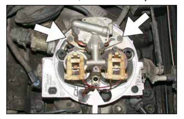
8. Remove the three factory torx screws as shown.