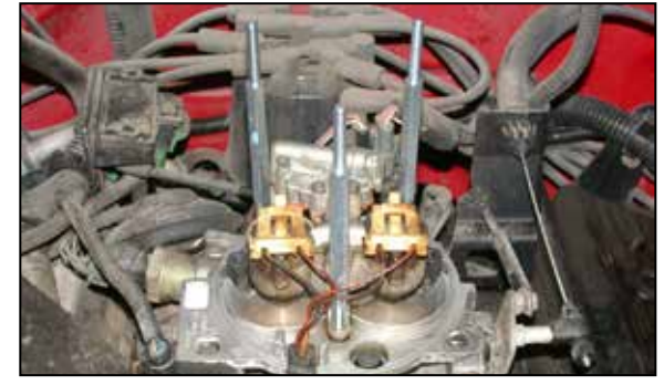
9. Install the three provided throttle body studs into the three holes from step 8.