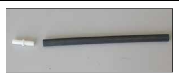
23. Assemble the silicone hose and hose mender as shown.