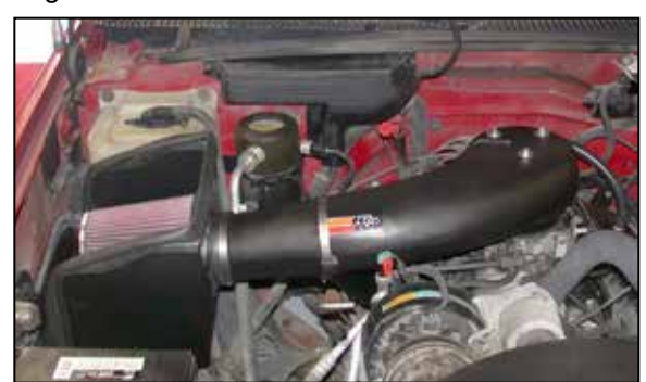
25. Reconnect the vehicle's negative battery cable. Double check to make sure everything is tight and properly positioned before starting the vehicle.