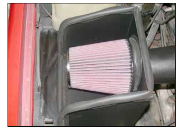
22. Install the K&N® air filter onto the K&N® intake tube as shown.