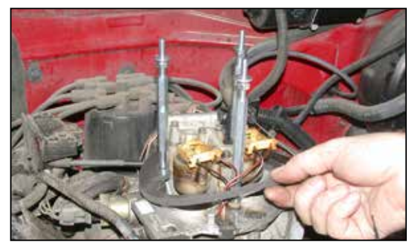
18. Remove the paper backing from the provided gasket and install the gasket onto the throttle body sticky side down.