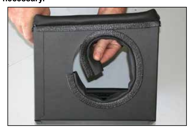
13. Install the short piece of trim seal to the heat shield as shown.