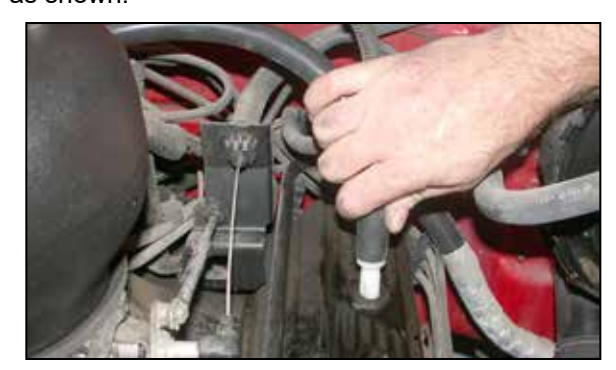
24. Install the silicone hose onto the vent on the K&N® intake tube, then push the hose mender into the grommet on the valve cover.