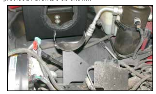
17. Install the saddle bracket assembly using the two bolts removed in step 15.