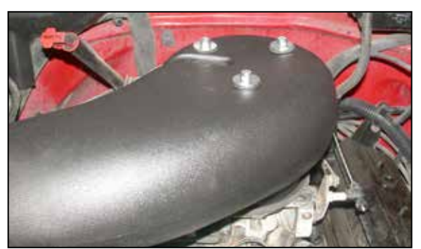
20. Reinstall the K&N® intake tube and secure it with the provided washers and nylock nuts.

NOTE: To set proper gasket compression, set the gap between the tube and the throttle body at 1/8". It may be necessary to adjust the nylock nuts several times to get the proper gap around the entire circumference. Each full turn of the nylock nut is equal to .050" up or down movement. Remove the tube when the proper gap has been achieved. Due to factory tolerances, it may be necessary to bend the EGR solenoid bracket downward to gain clearance for the K&N® intake tube.