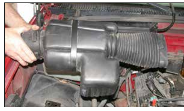
4. Loosen and remove the two bolts that secure the air inlet/resonator, then remove the assembly as

NOTE: Some vehicles are equipped with and air injection check valve which is vented to the air cleaner assembly. On these vehicles, remove the rubber hose and clamp the provided filter to the check valve.