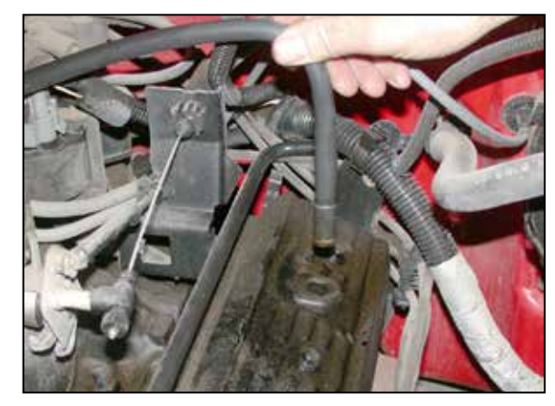
5. Remove the crank case vent line from the valve cover as shown.