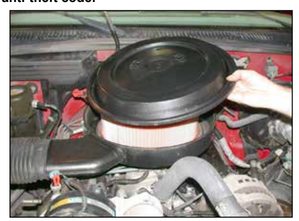
2. Loosen and remove the air cleaner wing nuts, then remove the air cleaner lid.

NOTE: Disconnecting the negative battery cable erases pre-programmed electronic memories. Write down all memory settings before disconnecting the negative battery cable. Some radios will require an anti-theft code to be entered after the battery is reconnected. The anti-theft code is typically supplied with your owner's manual. In the event your vehicles' anti-theft code cannot be recovered, contact an authorized dealership to obtain your vehicles anti-theft code.