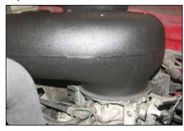
19. Install the K\&N^{\otimes} intake tube onto the throttle body.

NOTE: To set proper gasket compression, set the gap between the tube and the throttle body at 1/8". It may be necessary to adjust the nylock nuts several times to get the proper gap around the entire circumference. Each full turn of the nylock nut is equal to .050" up or down movement. Remove the tube when the proper gap has been achieved. Due to factory tolerances, it may be necessary to bend the EGR solenoid bracket downward to gain clearance for the K&N® intake tube.