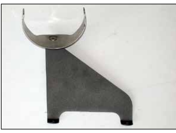
16. Assemble the saddle bracket assembly with the provided hardware as shown.