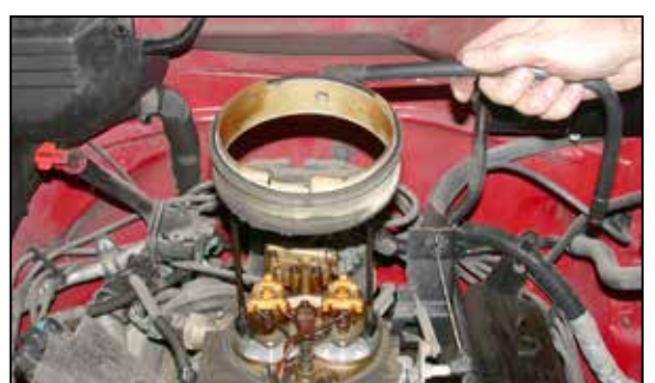
6. Remove the throttle body spacer as shown. NOTE: K&N Engineering, Inc., recommends that customers do not discard factory air intake.