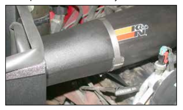
21. Secure the K&N® intake tube to the saddle bracket assembly with the provided hose clamp.