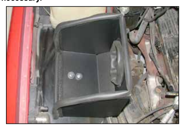
14. Install the heat shield to the inner fender using the provided hardware as shown.