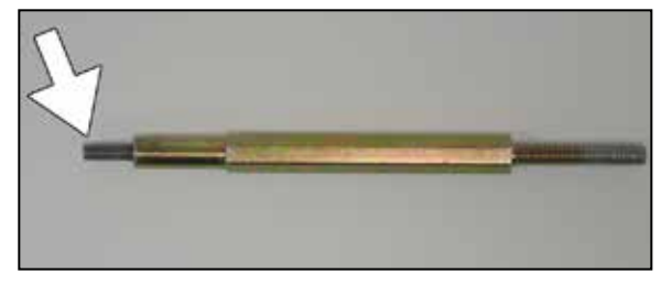
8a. Apply two drops of the provided thread locker onto the threads of the 5mm stud and then thread the stud into the tube mounting stud as shown.