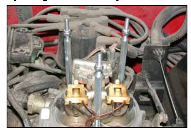
10. Install the three provided nylock nuts onto the throttle body studs approximately 3/4" down as shown.