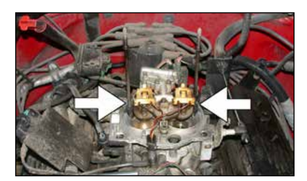
7a. On 92-95 vehicles, remove the two factory throttle body studs as shown.