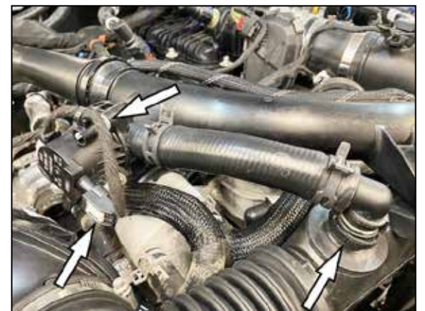
3. Release the BOV hose quick connect fitting from the factory intake tube. Then disconnect the BOV electrical connection and unhook the wiring harness from the mounting stud.