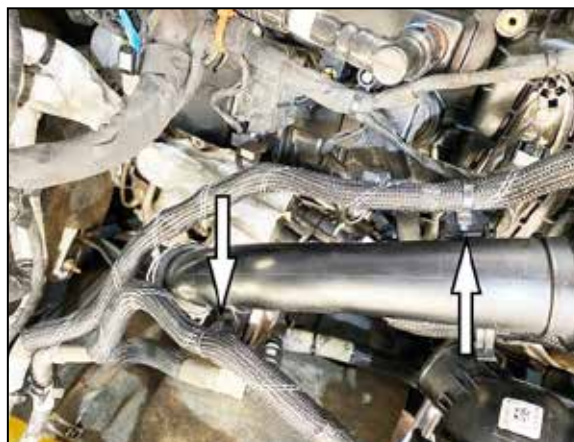
2. Disconnect the coolant hoses from the hot side charge tube.

NOTE: Disconnecting the negative battery cable erases pre-programmed electronic memories. Write down all memory settings before disconnecting the negative battery cable. Some radios will require an anti-theft code to be entered after the battery is reconnected. The anti-theft code is typically supplied with your owner's manual. In the event your vehicles anti-theft code cannot be recovered, contact an authorized dealership to obtain your vehicles anti-theft code.