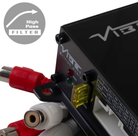
HIGH PASS FILTER

VERSATILITY - The compact size allows for the amplifier to be easily hidden, the auto sense means no remote wire is needed making for easier integration with systems.