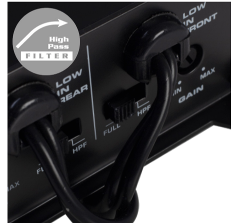
High Pass Filter

Class D technology allows for ultra efficiency and high power output, whilst keeping a small footprint for the amplifier.