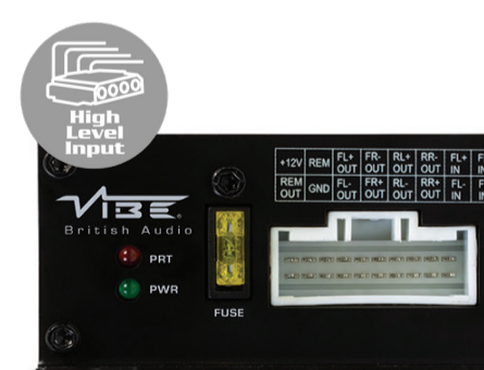
HIGH LEVEL INPUT

Micro architecture allows this amp to be installed in tight space, such as behind a glovebox. For a more OEM looking install.